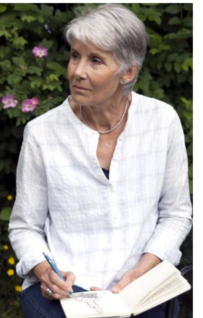
Exhibitions 2018 / 19 Sheffield Printmakers' Art House Exhibition. November

<u>www.sarah-burgess.com</u> www.textilestudygroup/members/ sarahburgess